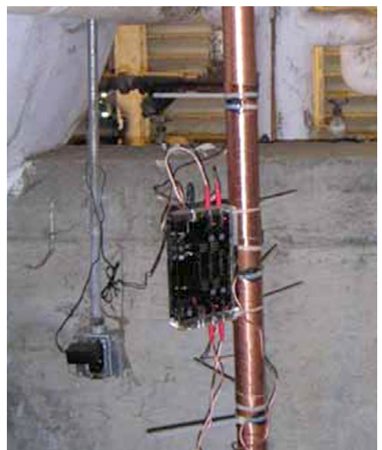
Vulcan S100 unit installed in a 465 bed complex which uses ground water