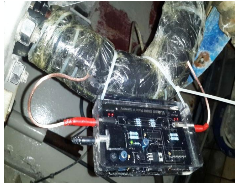
Vulcan 5000 was installed on the water inlet of the water recycling room.