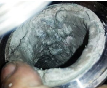
Before Vulcan installation: the pipe was full of scale deposits.