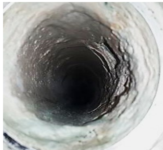
2 weeks after Vulcan was installed, scale had been softer and fallen out.