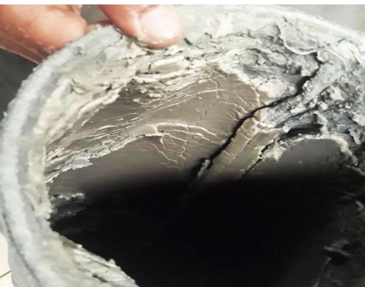
Without Vulcan, the filter was quickly stuck by scale deposits, and it had to be changed every 48 hours.