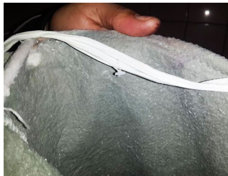
48 hours after Vulcan was installed, the filter still stays clean.