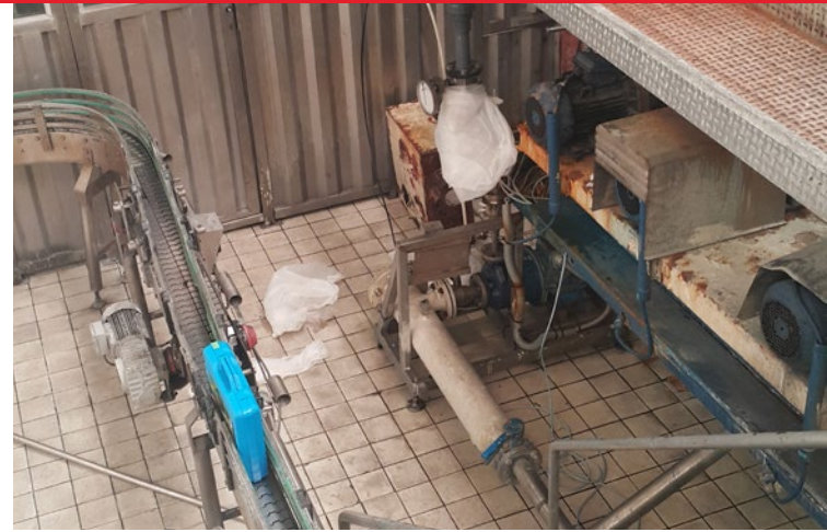
The Coca-Cola factory in Marrakech, Morocco