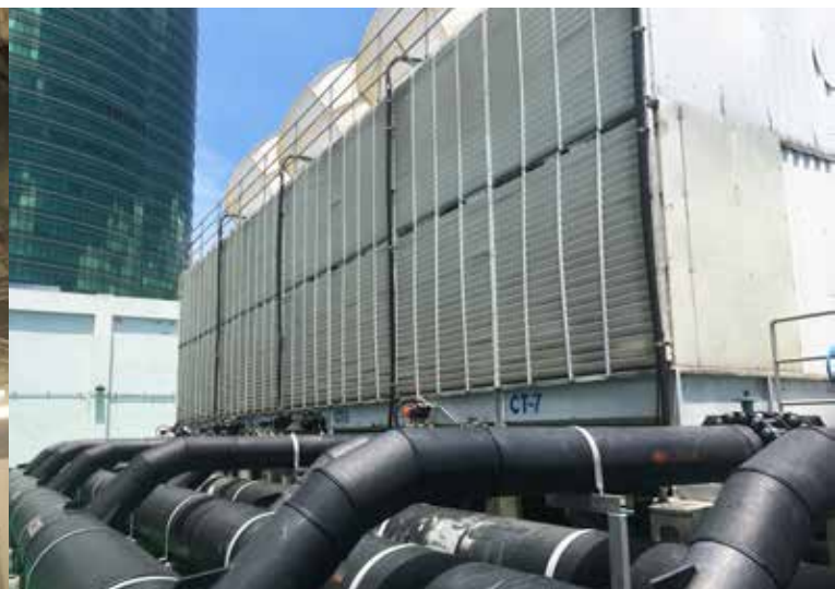
7 cooling towers were treated with Vulcan.