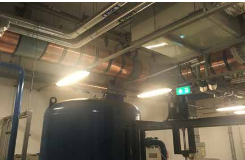
Vulcan S250 and X-Pro 1 were installed on the main return pipes of the condenser.

Vulcan was added together with the ozone system to treat the water. After 4 months, the approach temperature of the chiller has been reduced, so that the energy has been saved from the machine. Also, the scales from the cooling tower basin have been reduced.